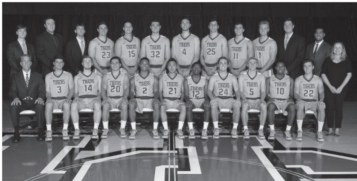
The 2016-2017 Tiger basketball team